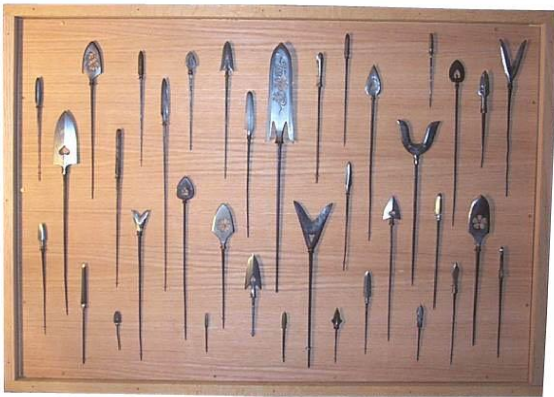
A Photo of a Japanese Arrowhead display showing the various types of arrowheads available to the Japanese archer from Northern California Japanese Sword Club website.